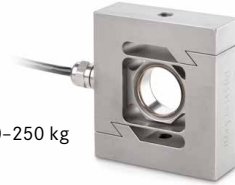
CS P2 50–250 kg

Fig. shows optional accessories traction device SAUTER CE Q12, for further accessories please visit our online shop