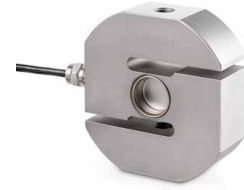
CS P2 0,5–7,5 t